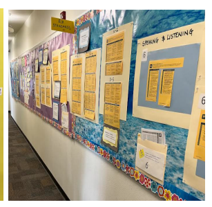
Go Bayview Dolphins!